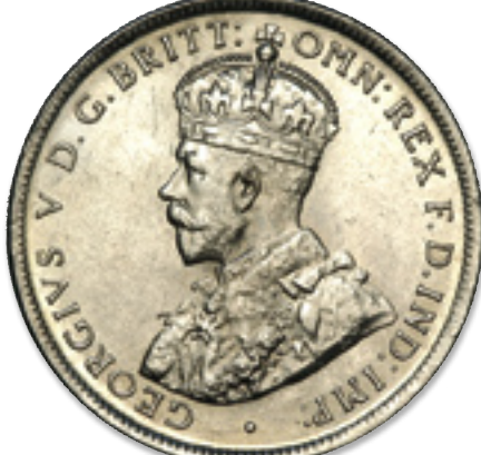
Choice Uncirculated Quite well struck, and only minor detail may be missing from the high points of the design. A scattering of fairly insignificant Detracting Marks may be present, but should not

attract undue attention. Mint Lustre or Mint Bloom should be of at least moderate presence. A very pleasing coin with much Eye Appeal.